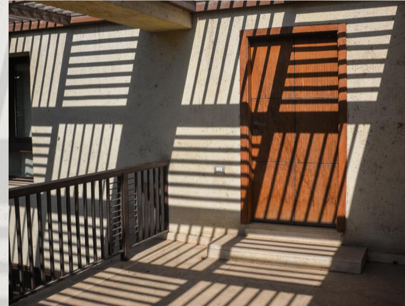
Maqsd house, Abusir, Cairo, 2006-2008.

Embassy of the Arab Republic of EGYPT Cultural Center & Educational Bureau London